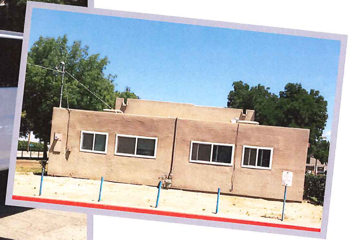
Parlier Migrant Center, housing